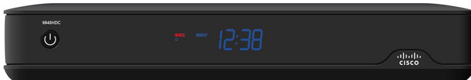
Figure 1. Cisco Explorer 9845 Video Gateway Front Panel (image may vary from actual product and specification)